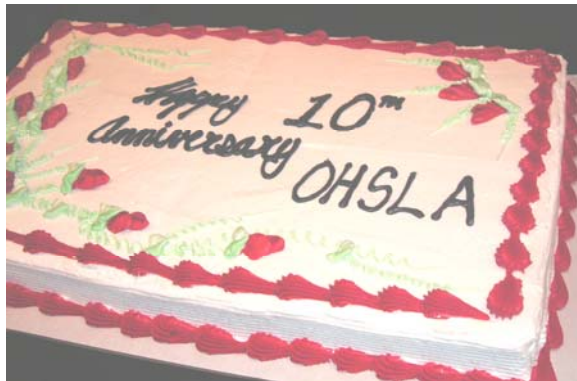
This birthday cake commemorating OHSLA's Tenth Anniversary was served at the Spring Meeting on April 22, 2004 at the Fawcett Center in Columbus.